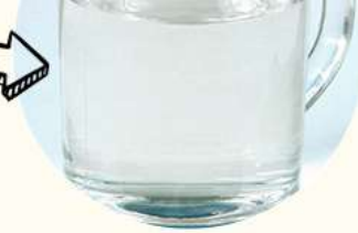
The extraction of aloe vera juice