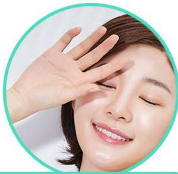
exposure to sunlight