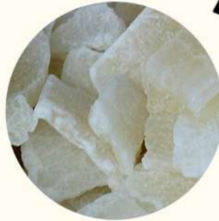
The dehydration (Lyophilization)