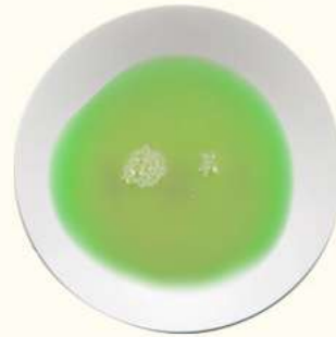
Aloe Vera Leaf Juice 30,000ppm + Aloe Vera Leaf Powder 500ppm

CICA ingredient and aloe vera leaf ingredient excellent in moisturization and soothing meet, they fill in moisturization to dry skin, soothe it and relieve stimulation from the outside circumstances or stresses.