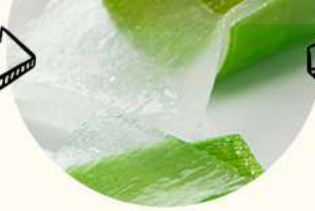
The extraction of aloe vera gel