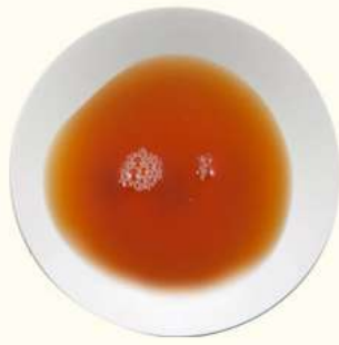
Centella Asiatica Extract 82.7%