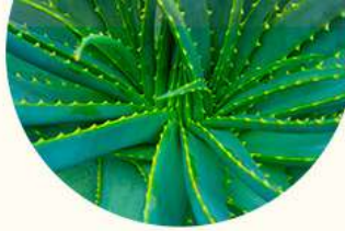
The harvest of aloe vera