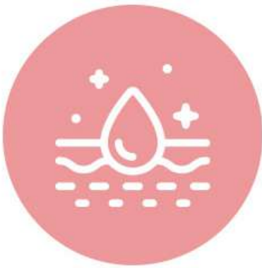
The cleansing of pores and waste matters

As a bubble mask pack that cares rough skin by various dirts and old keratin easily and conveniently, After you attach its Pack to face, as bubbles met with oxygen generate, soft and minute oxygen bubbles burst and then cleanse close pores neatly and cleanly. If you massage your face with its remaining bubbles, you can feel self-peeling effect.