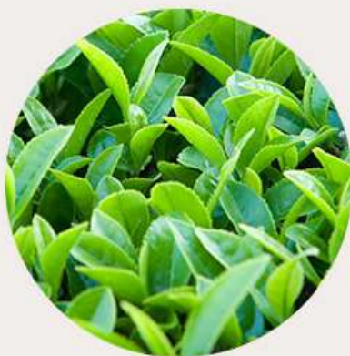
Various vegetable extracts