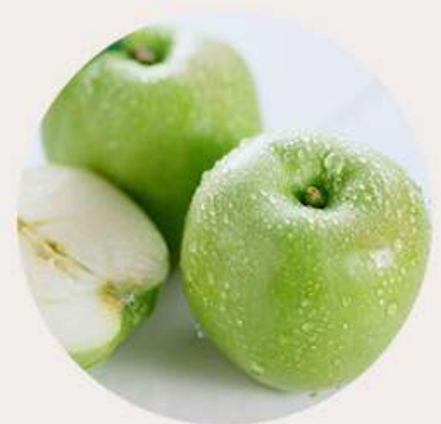
Sodium Cocoyl Apple Amino Acids