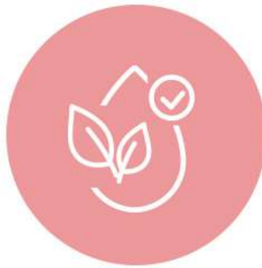
The Soothing of skin