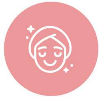
The purification of complexion