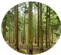
The various vegetable extracts