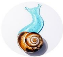
Snail secretion filtrate (300,000ppm)

Anti-wrinkle function certified (Material of adenosine)