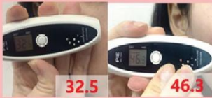
The above information is based on internal clinical data. 以上内容为内部临床资料。

Clinical test (hydration) perfect for daily use. 临床测试 (保湿感)